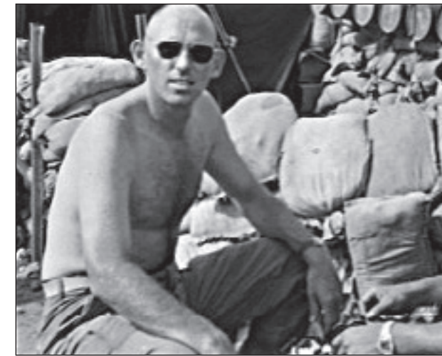
The ears are a dead giveaway!