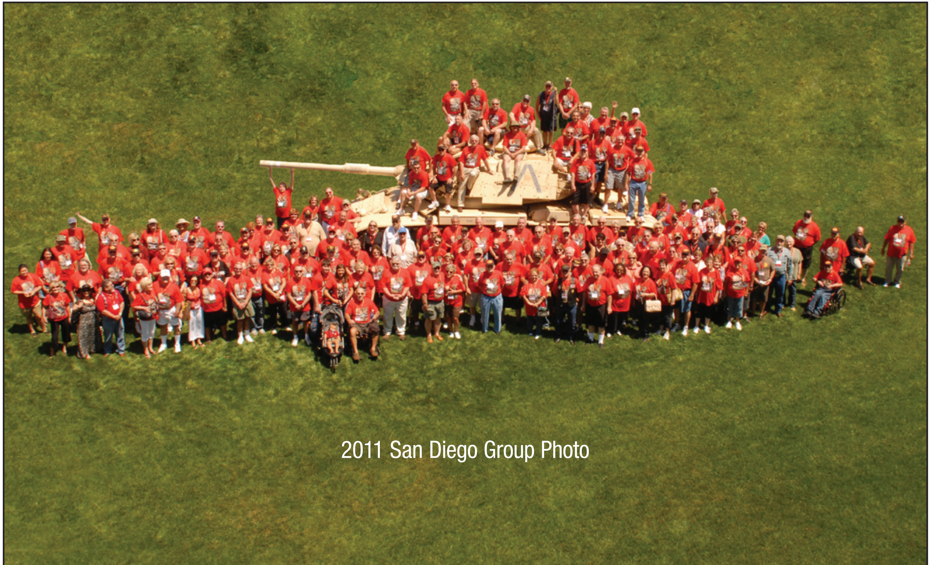
2011 San Diego Group Photo