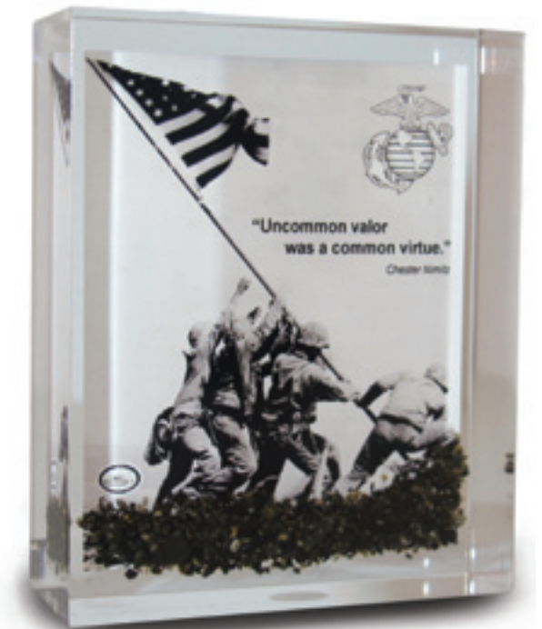
Block size is: 2.5" x 3.5" x .75"

Orders will ship about a month after the cutoff date. They will make excellent Christmas gifts for those Marines on your list.