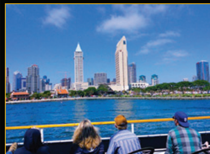
Harbor Cruise – a bit chilly!