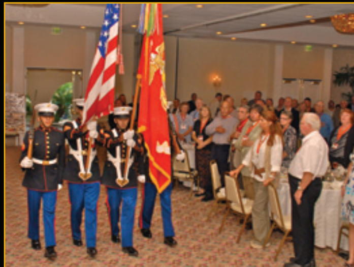
Color Guard at Farewell Dinner