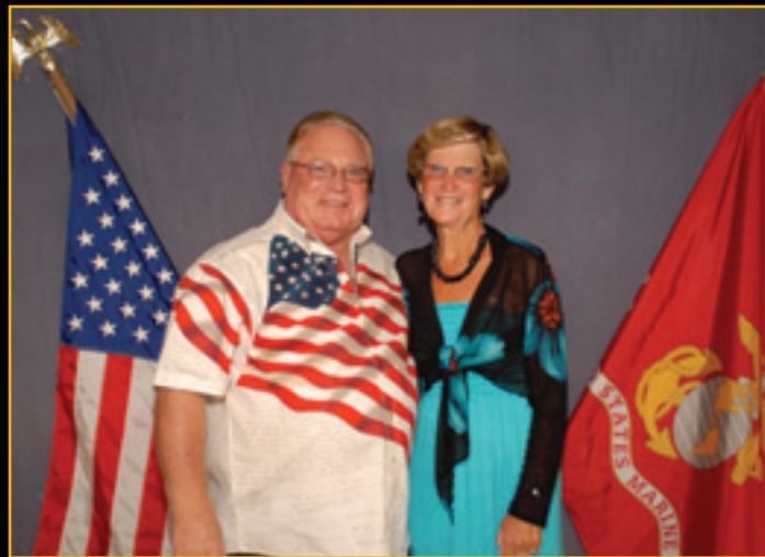
We got tired of saluting that shirt!