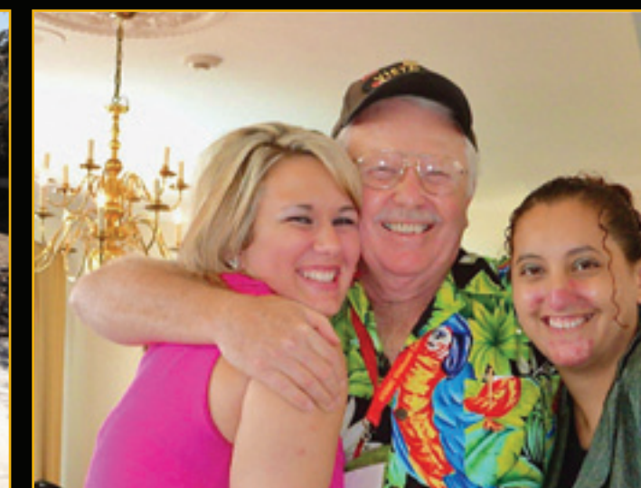
Doc always with the girls