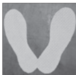
ON THE COVER: The yellow footprints at MCRD San Diego